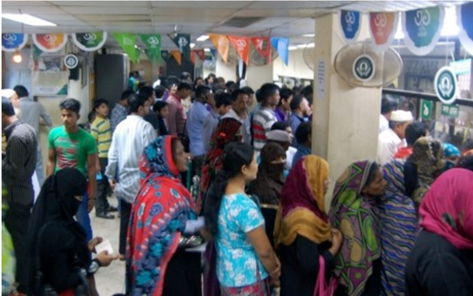
A typical day at a small town Islamic bank branch, which the bank's microfinance recipients are required to periodically visit. Air conditioning throughout makes the office a welcoming environment in the hot, humid summers. The presence of Buddhist clients (here, the woman in the blue shirt) is common. (Chittagong Division, Bangladesh, 2014)