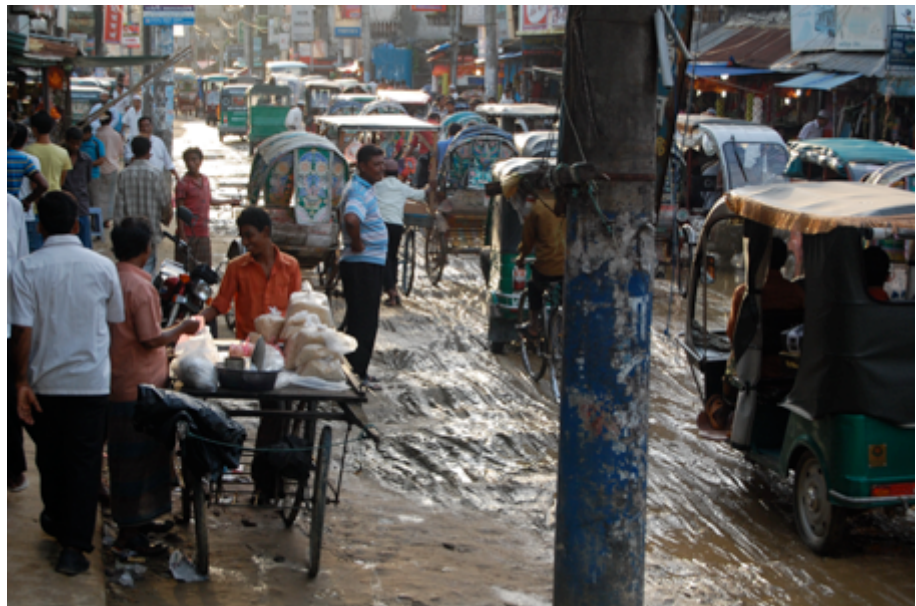
Main Road, field research site, Chittagong Division, Bangladesh, 2012

Finally, there is a lack of relationships between Islamic microfinance and digital tools that could easily promote product and platform innovation and aid service provision. The report offers starting points for digital interventions to meet the needs of the poor while addressing longstanding cost and value chain inefficiencies in Islamic (micro)finance. The Islamic Development Bank is arguably the best-positioned institution to currently act as a research and development hub for Islamic microfinance, shaping and testing new products and services, optimal legal environments, and basic computing requirements. The scope for the collaboration is high and the capacity for innovation in this still-nascent industry, where supply has not met demand, should encourage impatient optimism of industry observers, providers, and clients alike.