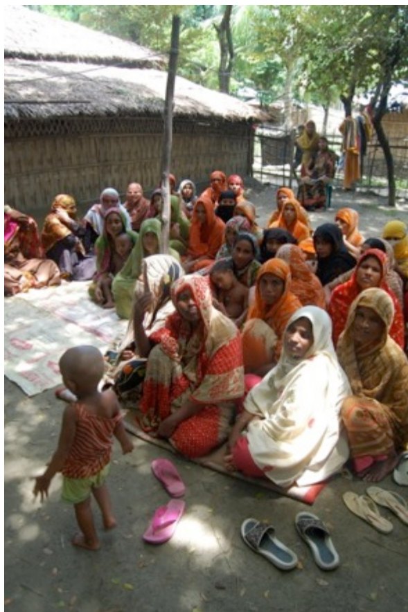
An Islamic microfinance collective gathers for its weekly repayment meeting (Chittagong Division, Bangladesh, 2010)

In 2013-2014, there were an estimated 38 million Islamic banking customers in the world (excluding Islamic microfinance). 82 In 2013, over 8.5 million of those customers belonged to IBBL. 83