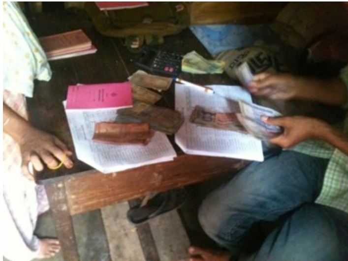
A field officer counts weekly microfinance repayments, often given in denominations of 5, 10, and 20 BDT notes (5 BDT equal about 6 USD cents). (Chittagong Division, Bangladesh, 2014)

Despite recent enthusiasm surrounding Islamic microfinance, providers are not awash in funds; NGOs have reported some difficulty in persuading donors. Limited resources tend to focus on improving officer-to-client ratios, client selection, and monitoring and evaluation. One way for IMFI to expand into public funding while avoiding non-Islamic capital markets debt financing and commercial loans is by accessing national zakat or waqf funds – forms of charitable giving in Islam (see Section 2.2). For example, billions of PKR are received via donation boxes at waqf properties in Pakistan annually, in excess of what is needed for property upkeep. 74 Innovative partnerships with religious organizations can also be pursued: Akhuwat, the market leader for Islamic microfinance in Pakistan, keeps its administrative costs low by basing its lending operations out of local mosques. Partnerships, whereby corporate zakat of IBFIs flows to IMFI, are another option that can be facilitated by multilateral bodies such as IsDB.