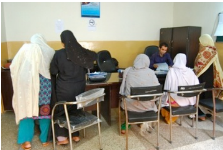
Islamic microfinance clients meet with their field officer at a field office. (Rawalpindi, Pakistan, 2013)

Second, IRP offers significantly larger financing than Akhuwat, and with shorter routes to receiving the higher financing amounts. Third, the professional environment of IRP's field offices makes it an appealing option for a more financially solvent poor demographic best positioned to benefit from the "productive purpose" financing for income generation. During our interviews, clients emphasized a preference for privacy when discussing personal financial affairs. Like IBBL in Bangladesh, IRP does not employ coercive repayment tactics (threats, harassment, embarrassment, selling off assets, house-breaking) that can be common in conventional microfinance. Compassion toward late payments maintains an ultimately high repayment rate and positive relationships between field staff and clients.