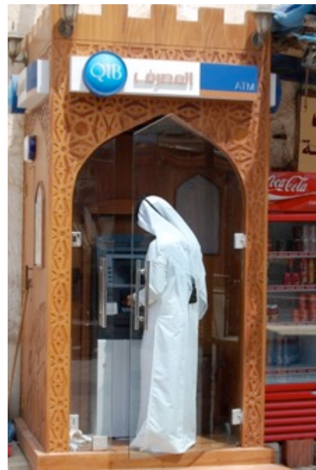
Qatar Islamic Bank's Shari'a compliant ATM (Doha, Qatar, 2010)

The modern Islamic finance industry is only the latest incarnation of Islam's long engagement with economics. The Qur'an links economic accounting with the spiritual accounting conducted upon death, before God, and these verses are often included in IBFs' annual reports, websites, and other documents. 15 The “remembrance of death” 16 this yields during one's earthly life keeps the