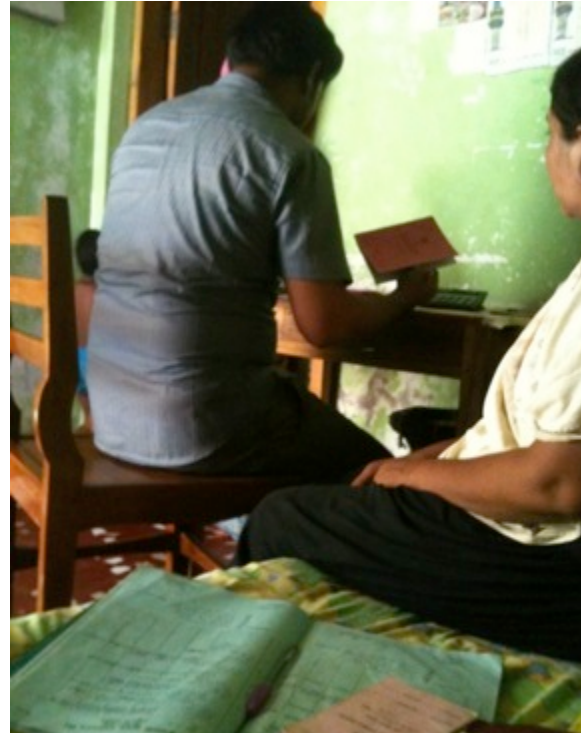
Islamic microfinance field officer collecting weekly repayments (Chittagong Division, Bangladesh, 2014)

A broad demand-side argument also risks grouping together countries with different gender practices and political and cultural environments. For example, Pakistan has a successful and well-regulated microfinance industry—but it is concentrated in the Punjab and Sindh provinces for political, security, and feasibility reasons. In the vast, underserved Balochistan and Khyber Pakhtunkhwa provinces, microfinance providers have either scaled back or ended operations. Providers and their reputations also matter: contentious national government involvement in tribal areas or against separatist groups has led to suspicion of government-related activities. Histories of unsuccessful foreign development aid and military activity have led to distrust of large multinational and/or Western organizations. By contrast, Islamic NGOs such as Islamic Relief, Muslim Aid, IsDB, Red Crescent, and small, village banks find greater receptivity, and might be more suitable Islamic microfinance partners than a large bank, NGO, or government fund.