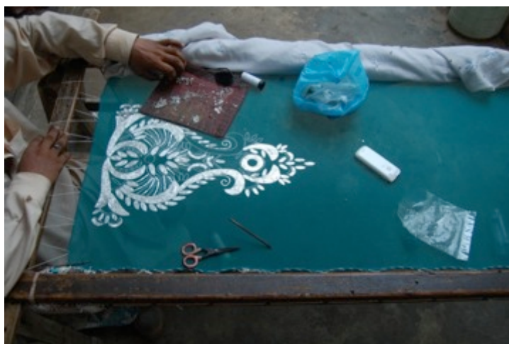
Islamic microfinance-funded home-based income generation. (Rawalpindi, Pakistan, 2013)

The financial inclusion sector in Pakistan is also dynamic: MFIs can avail SBP's Microfinance Credit Information Bureau, launched in 2012, with data continuously being added. Microfinance client national ID card numbers can be entered in a database, enabling future MF providers to assess credit history and ensure that they are not contributing to cyclical indebtedness, whereby new microfinancing is used to pay down outstanding loans. 117 Microfinance institutions continue to see an uptick in clients using savings facilities. 118 EasyPaisha, a partnership of Telenor Pakistan and Tameer Micro Finance Bank, is a successful mobile money platform, although like most mobile money platform, one-off over-the-counter transactions outstrip durable consumer 'wallet' accounts.