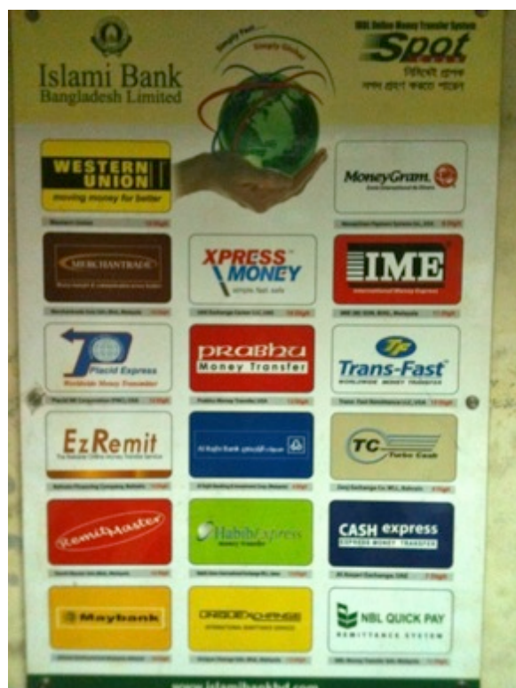
Remittance partners advertised at an Islami Bank Bangladesh Limited branch (Chittagong Division, 2014)

densely populated microfinance market by offering services for the poorest ("ultra-poor") Bangladeshis, with interest rates charged on a sliding scale according to the type of loan and the recipient's background.